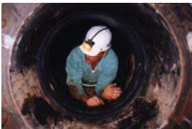
Install Rubber Seal