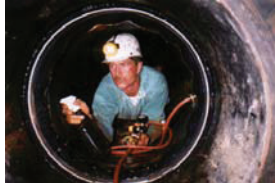
Check for Leaks