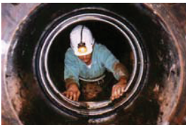
Install Retaining Bands