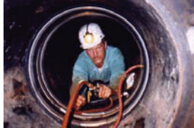
Pressure Test Seal