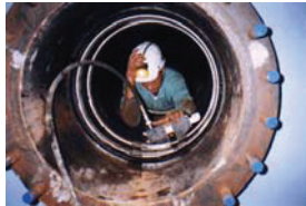
Expand Bands with Expander