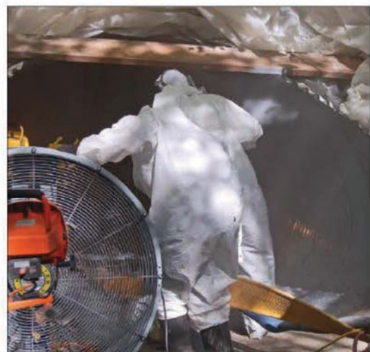
Proper personal protective equipment is vital to employee safety during PolySpray application.

Engineer Griffiths adds, "The use of PolySpray SS-100 gave the city an excellent, cost-effective solution to repairing the deteriorating culvert. We are pleased with the outcome of the project and the work performed by E.B. Miller Contracting." ♦