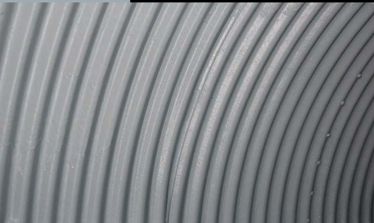
PolySpray SS-100 polyurea lines the inside of the rehabilitated culvert, providing excellent corrosion and abrasion resistance.